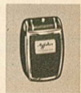
Agfa B-C Flashgun Folds Pocket-size—