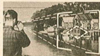
Coupled Rangefinder for Easy Sharp Focus—Luminous lines from your subject.